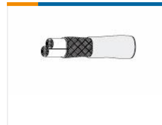
TE Part #812455-000 55A1123-22-9/96-9CS2275