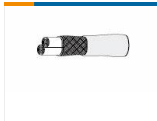
TE Part #272103-000 55A1123-20-9/96-9CS2275