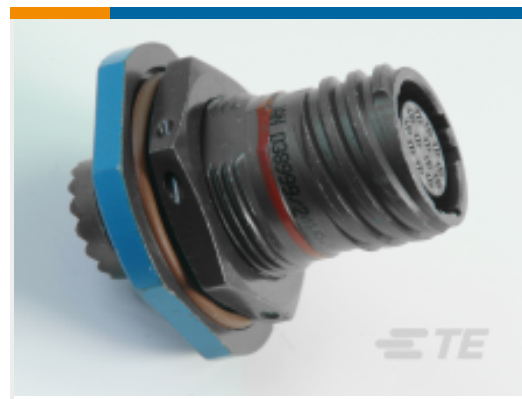
TE Part #YDTS24T23-55SNV001 RECP ASSY