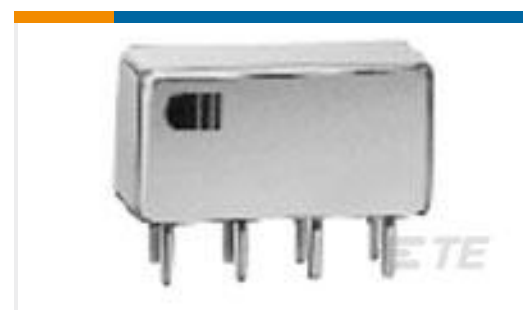
TE Part #3-1617029-6 HFW1131K05M = M39016/6-207M