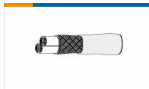
TE Part #169311-000 55A1822-24-9/96-9CS2275