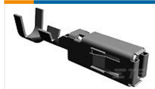
TE Part #1-968876-3 AMP MCP 2.8, CONTACT SWS (LP)