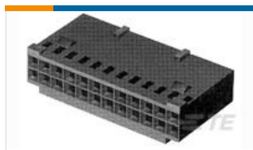
TE Part #1-87631-7 22 MODIV HSG COMP DR .100 POL