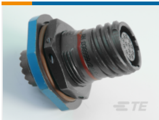
TE Part #YDTS24T23-55SNV001 RECP ASSY