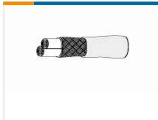
TE Part #812455-000 55A1123-22-9/96-9CS2275