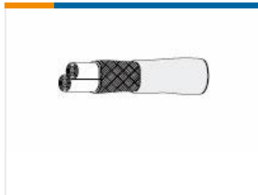
TE Part #272103-000 55A1123-20-9/96-9CS2275