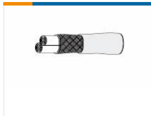
TE Part #812455-000 55A1123-22-9/96-9CS2275