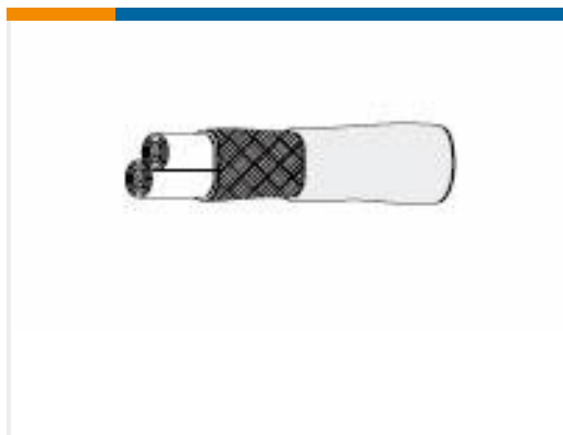
TE Part #272103-000 55A1123-20-9/96-9CS2275