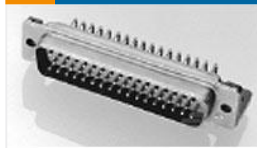
TE Part #1218434-4 R/A RCP ASSY 37 POS SER 109