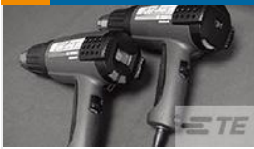
TE Part # CJ2087-000 HL2010E-KIT-120V