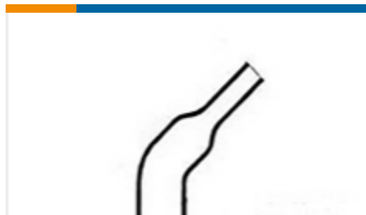
TE Part #806654-000 243A012-25-0