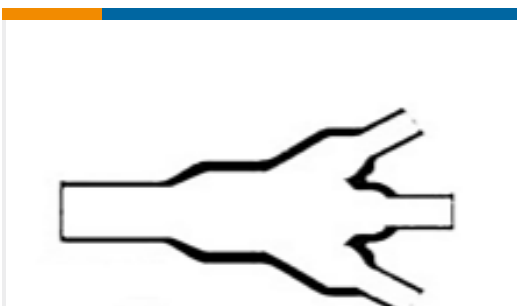
TE Part #823774N001 462A023-3-0