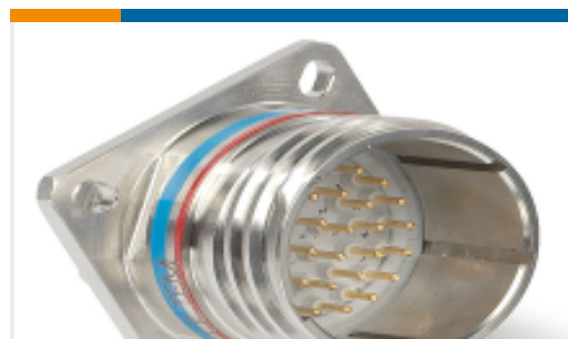
TE Part #YACT20ME99PAV00200 SQUARE FLANGE RECEPTACLE