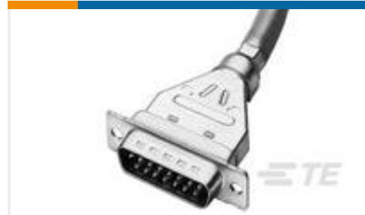
TE Part #1658650-1 KIT,HDP-20,OVRMLD,PLUG,SIZE 4,