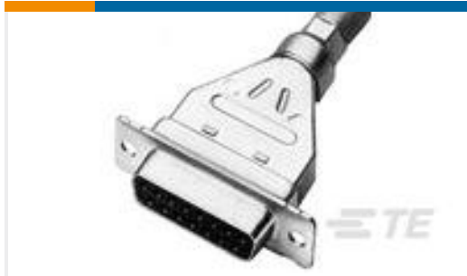
TE Part #1658651-1 KIT,HDP-20,OVRMLD,RCPT,SIZE 4,