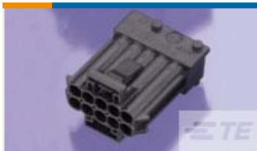
TE Part #1-962375-1 2P MESSERLEIS-GEH