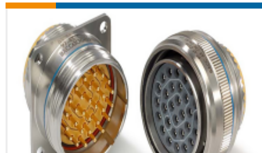
TE Part #ZPF000000000036889 983-6SE 10-05 S7