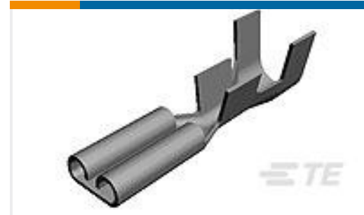
TE Part #160780-4 110 FASTON,REC.,16-20 AWG,TPBR