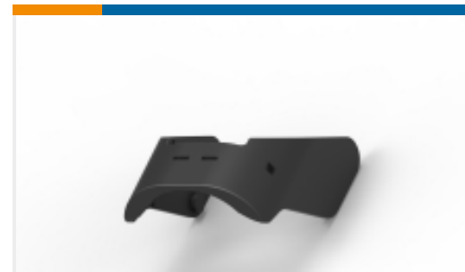
TE Part #1-1355133-1 HEBEL F.AUFNAHM-GEH