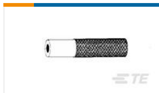
TE Part #0059013002 RAY-101-20.0(50)