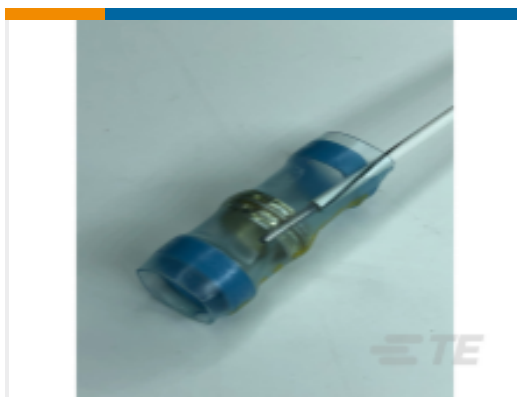
TE Part #EG7059-000 SO63-3-01CS4036