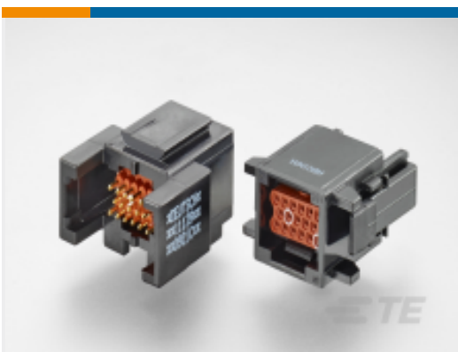
TE Part #ABC06N-20P IN-LINE PLUG