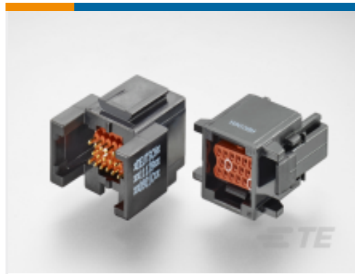
TE Part #ABC03N-16S IN-LINE RECP