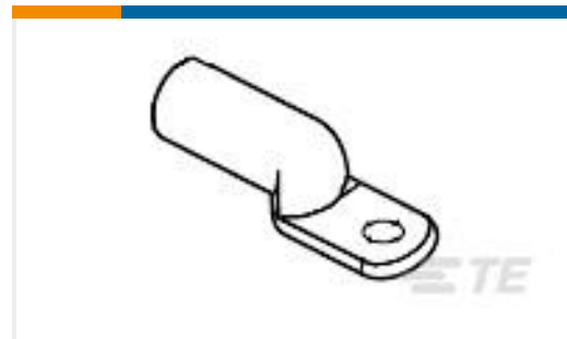
TE Part #277151-7 TERMINAL,COPALUM R 1/0 5/16