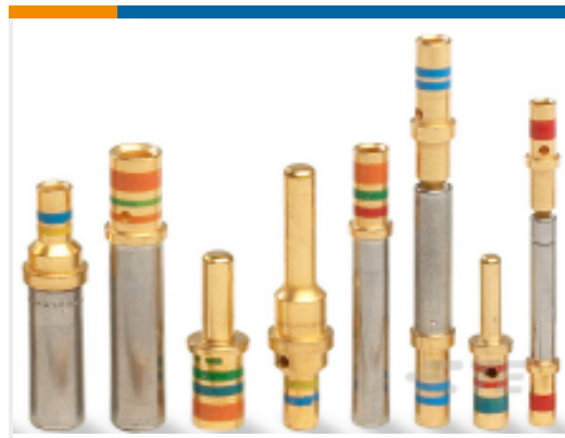
TE Part #2560-212-2031 CONT PIN