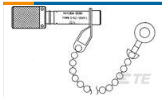
TE Part #320677-000 D-621-0417-L