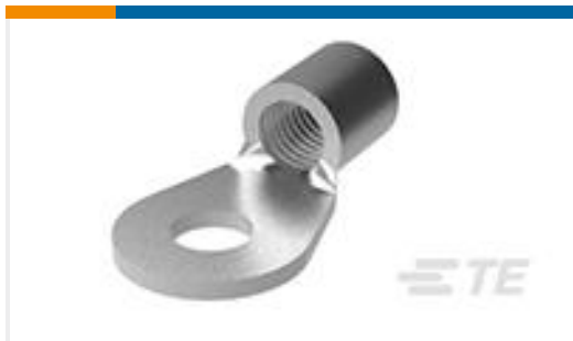
TE Part #132104-2 TERMINAL RING TONGUE SOLISTRAN