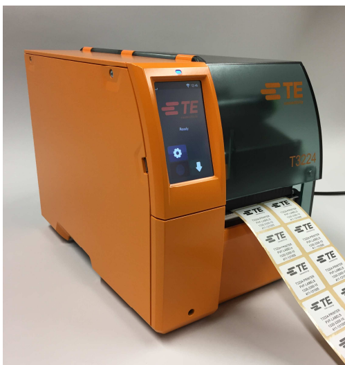
T3224 printing labels

For more details regarding printer accessories please consult TTDS-260, and for more details concerning the Universal payoff please consult TTDS-259.