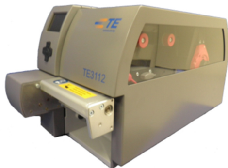
TE3112 fitted with, metal cover and Cutter/perforator