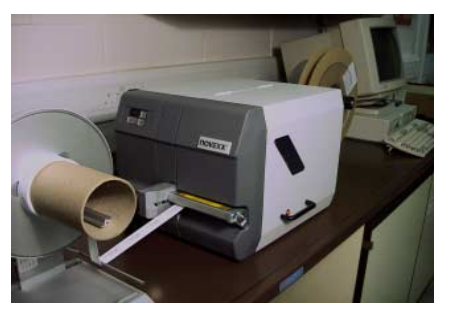
TMS 2000Plus in-line thermal transfer printer