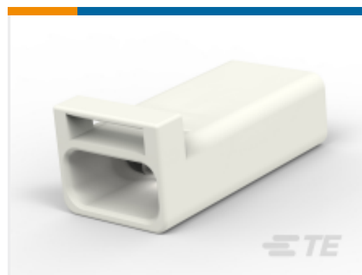
TE Part #1-2834075-2 2P REC, MINIATURE WATERPROOF CONN.WHITE