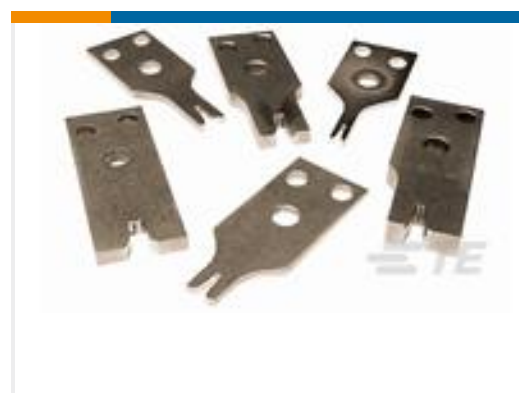
TE Part #2-1338223-0 CRIMPER, MODIFIED