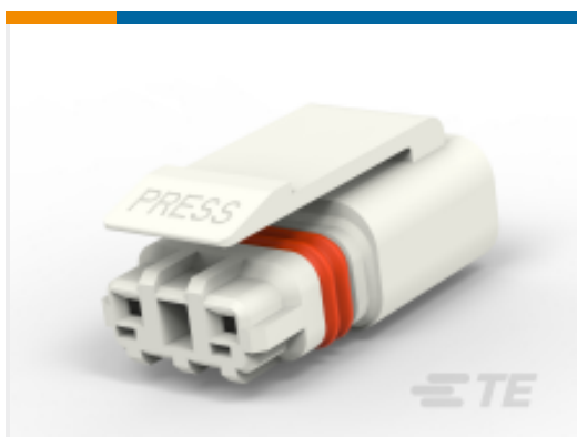
TE Part #1-2834074-2 2P PLUG, MINIATURE WATERPROOF CONN.WHITE