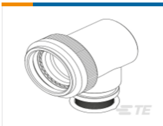
TE Part #A35292-000 TXR40SJ90-2412BI