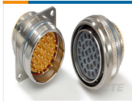
TE Part #ZPF000000000036665 983-6S 20-16 PN-L