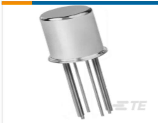
TE Part #1617132-5 JMSWD-48XM = M39016/16-022M