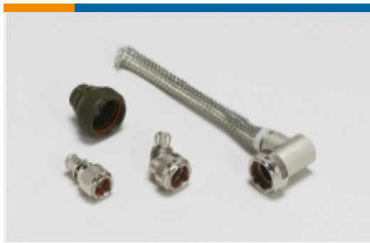
Ruggedized Backshells & Adapters (2821)