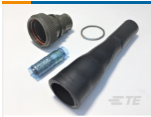
TE Part #C99561-000 1814-10-340810