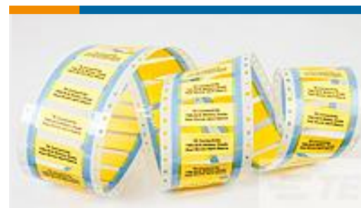
TE Part #002308-000 TMS-SCE-1K-3/4-2.0-0