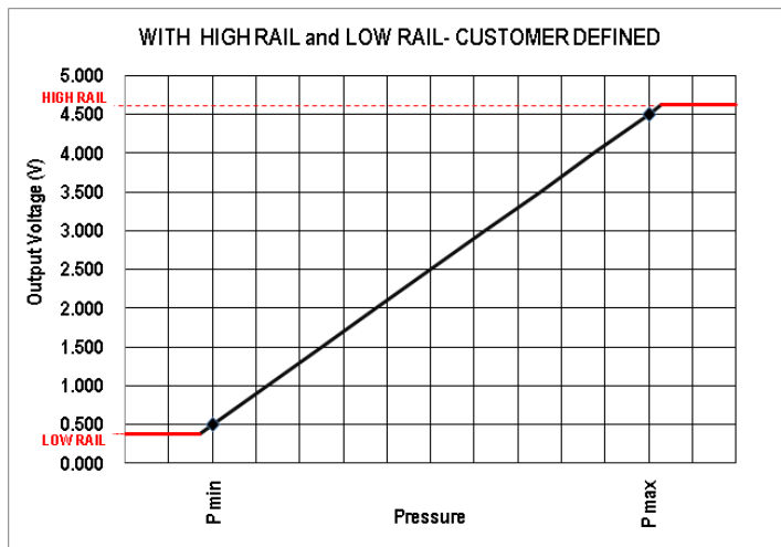
OEM Custom Calibration High/Low Rail values can be adjusted by circuit