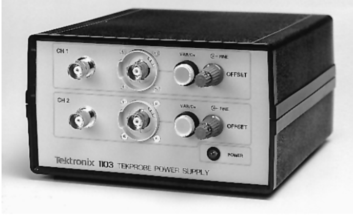
1103 TekProbe Power Supply.