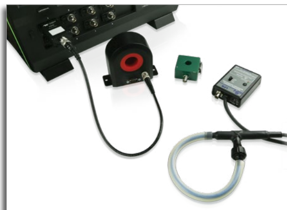
CA10 ProBus current adapter attached to a Danisense Current Transducer. Also shown is a Pearson Current Transformer and a PEM-UK Rogowski Coil, which are also third party devices that can be used with the CA10.