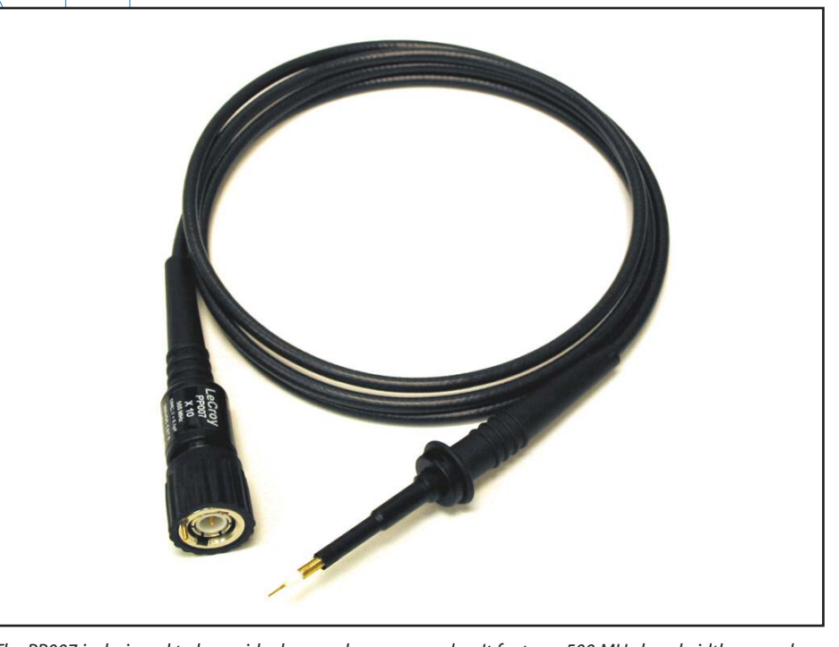
The PP007 is designed to be an ideal general purpose probe. It features 500 MHz bandwidth, rugged design and a wide assortment of accessories.