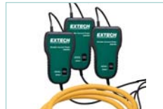
Optional 3000A Flexible Current Clamp Probes 24" (610mm) long for wrapping around busbars (Model 382098)