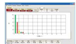
Software Harmonics Analysis