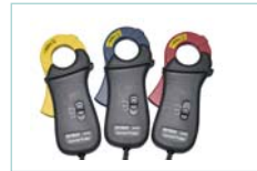
Optional 100A Current Clamp Probes (Model 382097) with 1.2" (30mm) jaw size