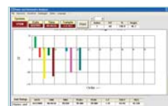
Software Harmonics Phase Analysis