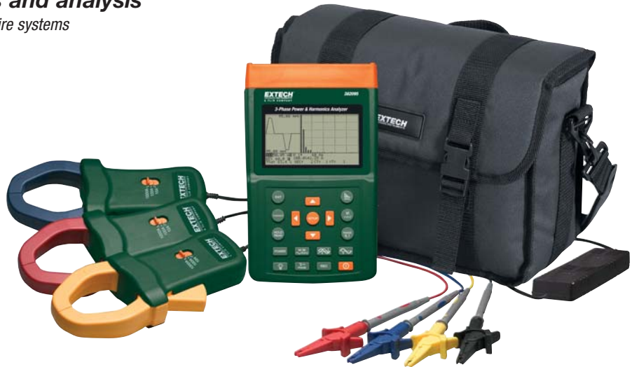
Complete with (3) 1000A current clamps, 4 voltage leads with alligator clips, 8 AA batteries, AC adaptor, software, PC interface cable, and carrying case