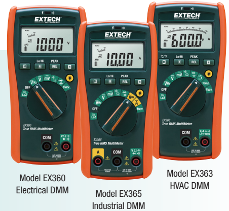
Model EX360 Electrical DMM

True RMS provides accurate readings when measuring distorted or noisy waveforms. Choose a model designed for Electrical, HVAC, or Industrial Applications. Advanced LoZ feature eliminates false readings caused by ghost voltages. CAT IV safety rating ensures the highest level of protection.