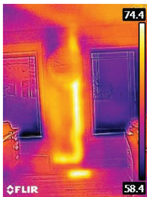
Warm Drain Pipe in Wall