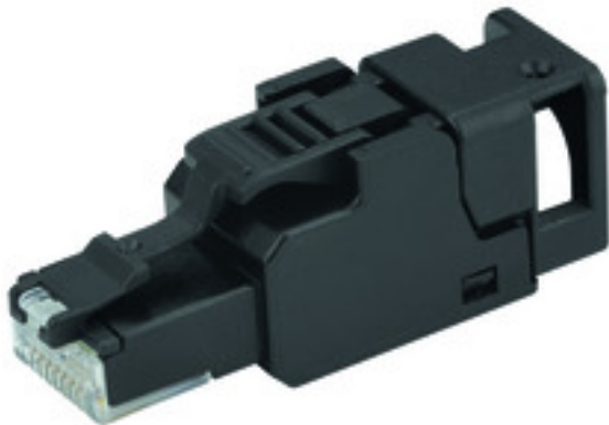
Fig. may differ

unshielded field assembly RJ45 plug UFP8 T568 B Cat.6 A , AWG23/1-AWG22/1; AWG23/7-AWG22/7