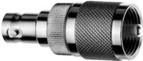
Fig. may differ