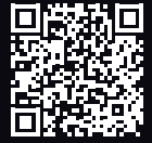
RUT901 360° VIEW

// The RUT901 cellular router delivers the top-rated features of its predecessors, the RUT950 and RUT951, to the market.