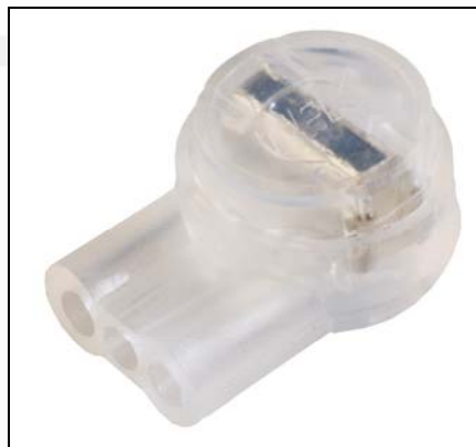
8B type gel crimp (XJRBdg)

Gel crimps are essential connectivity items for telecoms cabling installers. The featured products are approved and supplied into BT Openreach.