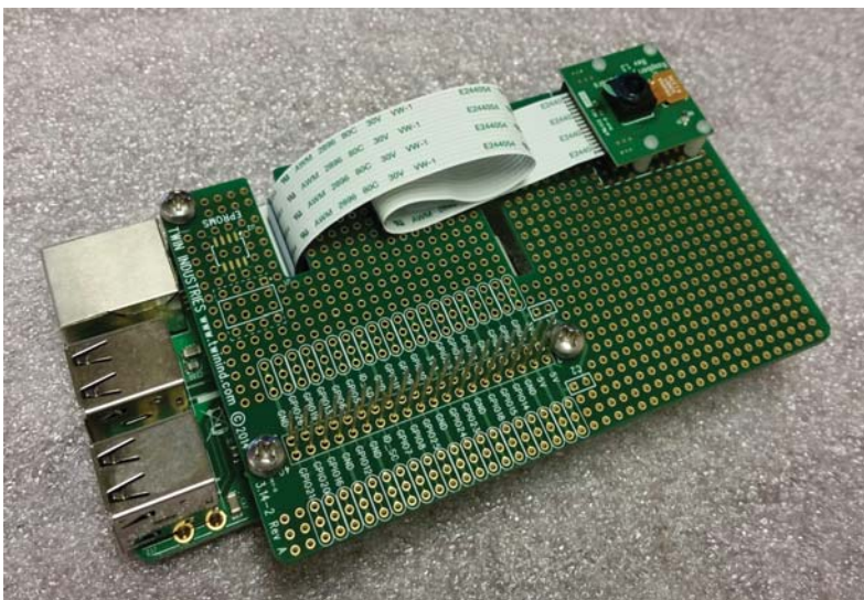
Part#3.141-2 (with accessories) Raspberry Pi B+ and accessories sold separately