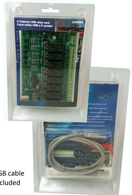
USB cable included