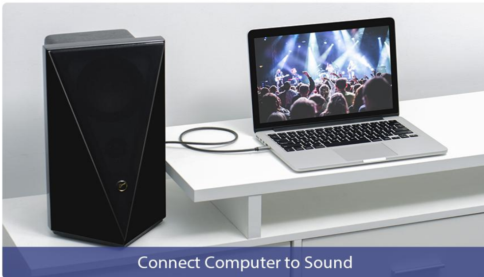
Connect Computer to Sound