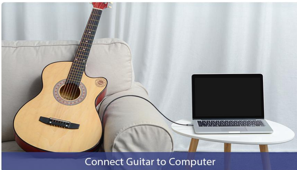
Connect Guitar to Computer