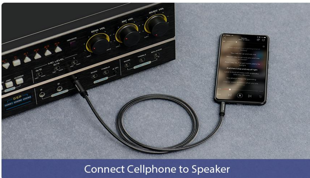
Connect Cellphone to Speaker