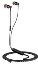
USB-C digital headset