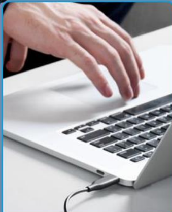
PC without LAN interface