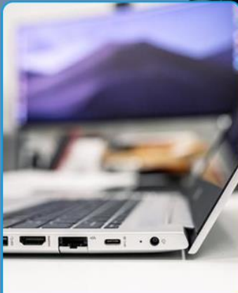
Network card damage