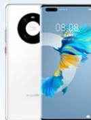
Huawei Mate30 Mate30 Pro