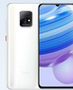
Xiaomi 10 10 Pro