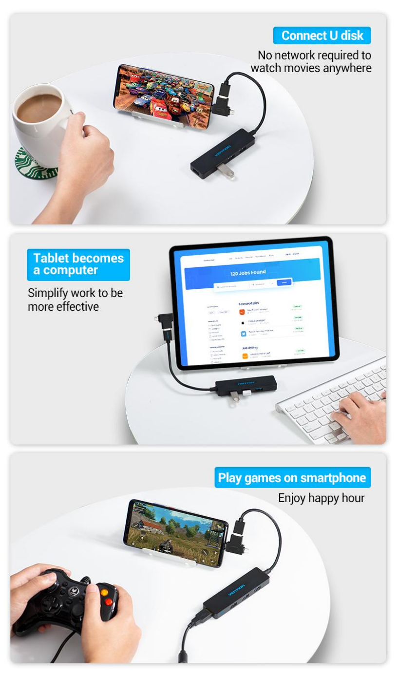
Note: Smartphone need to support OTG and connect the OTG adapter to use

Expand your phone/tablet for more potential