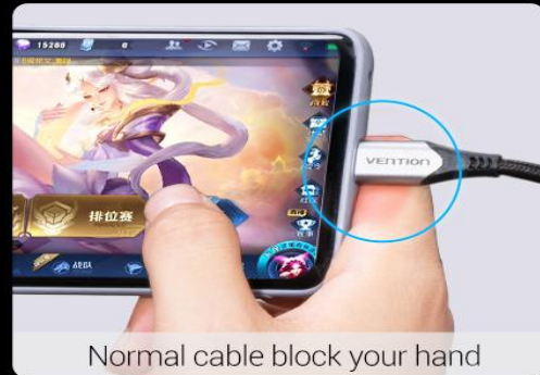
Normal cable block your hand