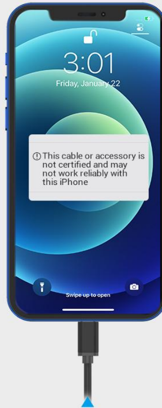
Non-MFi Certified Cable, Unstable and incompatible