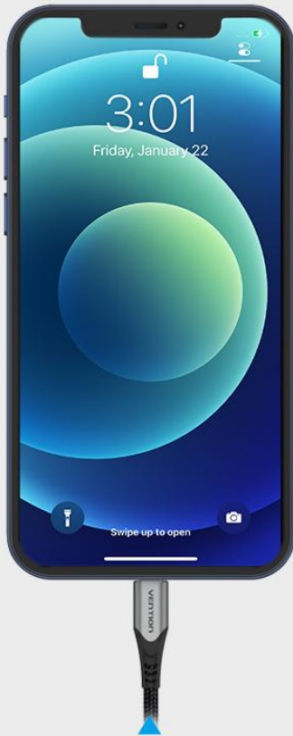
MFi Certified Cable, Fully compatible with iOS

Synchronized with updated system fully compatible with iOS