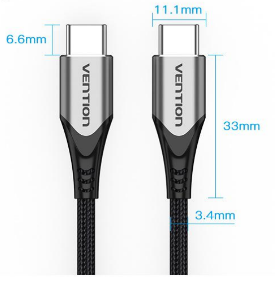
Note: All data are from Vention Lab Sizes above are manually measured.There might be slight tolerance