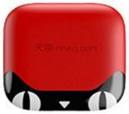
Tmall magic box