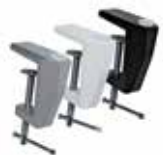
A-Edge Mount Bracket