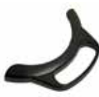
KFM LED Handles