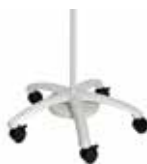
Floor Stand (Trolley) With Extra Weight