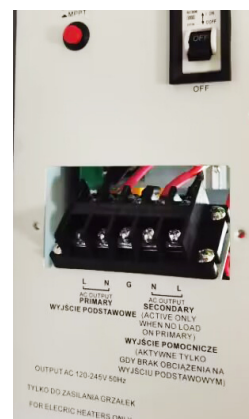
GREEN BOOST MPPT 3000T