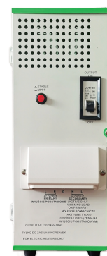
GREEN BOOST MPPT 3000T