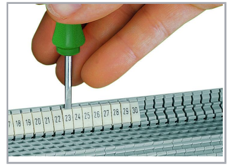
Snapping a WMB marker strip into the marker slot of the double marker carrier.