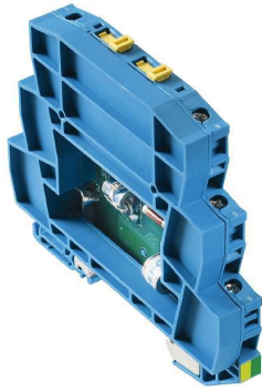
Similar to illustration