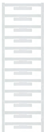
WAD 5 MC NE WS