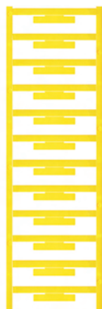
WAD 5 MC NE GE