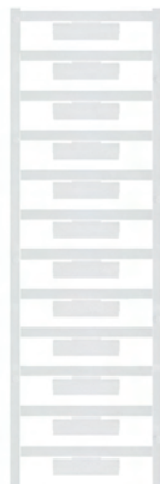
WAD 8 MC NE WS