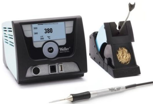
WX 1 control unit with WXMP Micro soldering pencil (40W / 12V) and WDH 50 safety rest