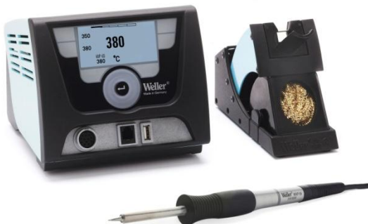
WX 1 control unit with WXP 65 soldering pencil (65W / 24V) and WDH 50 safety rest