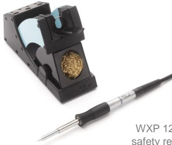
WXP 120 set with safety rest WDH 10