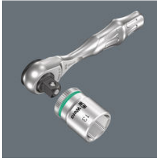
Simple direction change