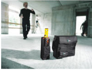
Wera 2go 7 high tool box.