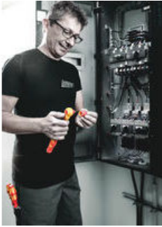
Zyklop ratchet and accessories for Electricians