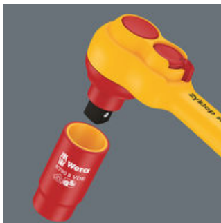
The ball lock ensures sockets and accessories are securely fitted, providing increased safety during operation. A short press on the release button allows the tool to be changed quickly.