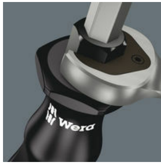
Hexagonal blade and bolster for higher torque transfer.