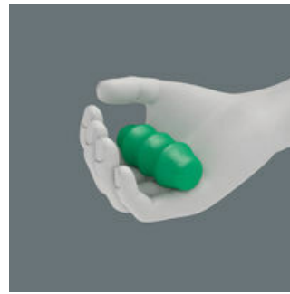
The basic idea for the prototype of the Kraftform handle – that the hand should dictate the design – has, right through to today, proved to be correct. In cooperation with the internationally recognised Fraunhofer IAO Institute, Wera developed a screwdriver handle designed to match the shape of the human hand as long ago as the 1960s. After a long development phase, the Wera Kraftform handle was launched to the market in 1968. It has been optimised through the years with new technologies, but has kept its proven shape. After all, the human hand has not changed either.