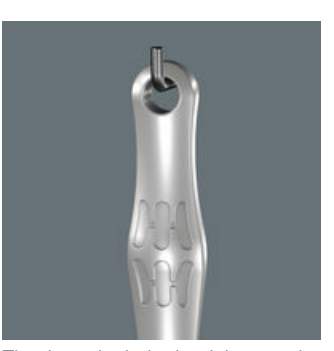
Thanks to its hole the Joker can be neatly hung on the workshop wall.