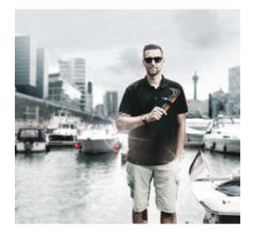
We questioned the classic L-key design, since all too often the screw head recess is rounded out, meaning screws can no longer be tightened or loosened - and so the user finds the L-key slipping out of the recess. Wera Hex-Plus tools have a larger contact surface in the screw head. The notching effects are reduced and thereby the deformation of the screws. At the same time, as much as 20 %more torque can be applied.