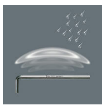
Chrome-plated hexagon L-keys for outstanding surface protection and long service life. High corrosion protection.