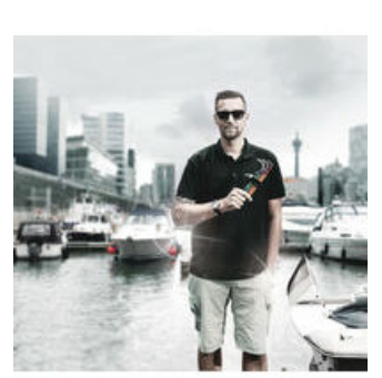
We questioned the classic L-key design, since all too often the screw head recess is rounded out, meaning screws can no longer be tightened or loosened - and so the user finds the L-key slipping out of the recess. Wera Hex-Plus tools have a larger contact surface in the screw head. The notching effects are reduced and thereby the deformation of the screws. At the same time, as much as 20 % more torque can be applied.